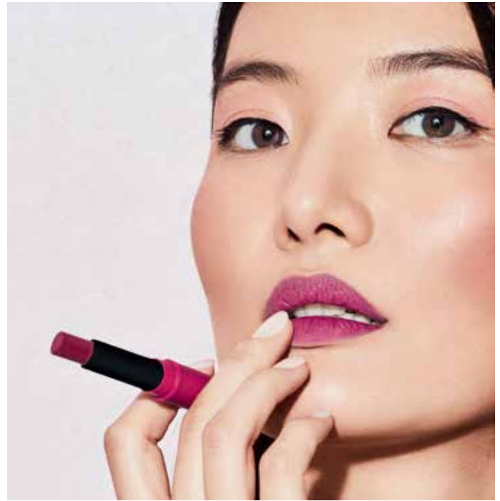
The model is wearing: Color Fix No. 04.