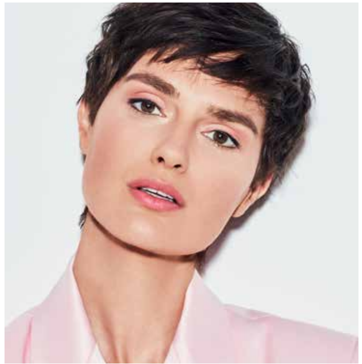
The model is wearing: Color Balm No. 03.