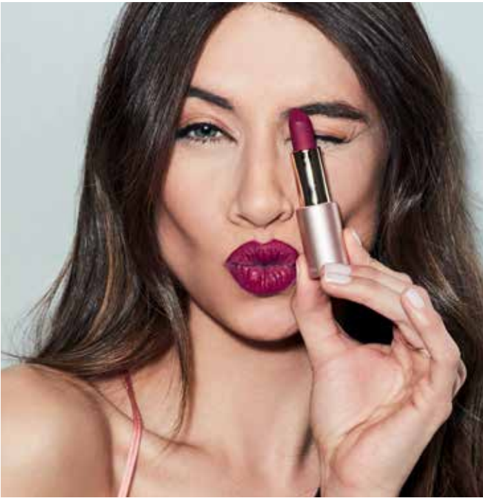
The model is wearing: Matte No. 109.