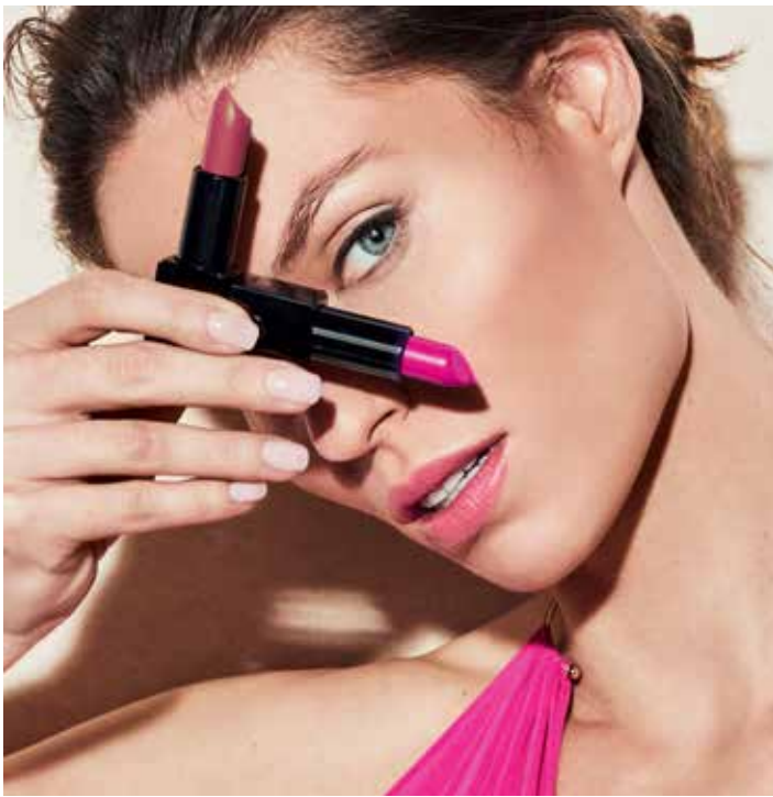
The model is wearing: On her lips, Creamy No. 204. And on her hands, Creamy No. 204 and No. 205.