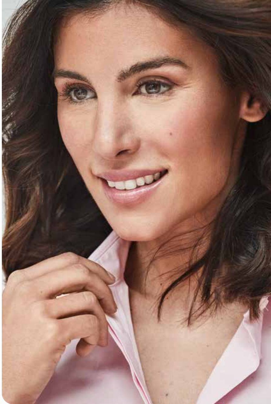
Day look (see page 10).