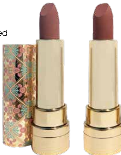
The Mosaic lipstick No. 01 latte.