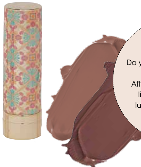
The Mosaic lipstick No. 02 mocha.