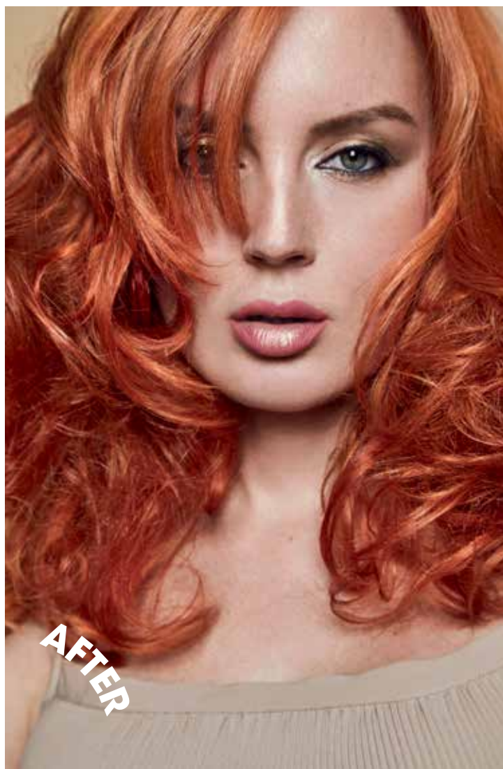
The model is wearing: Colorcor Reviva copper tone hair mask.