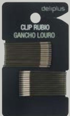
Hair clips and fine bands.