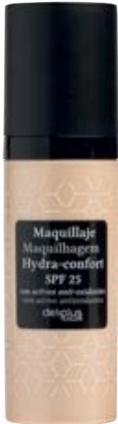
Hydra-comfort SPF 25 make-up