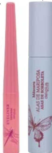
No. 04 aubergine Intense Natural Passion Eyeliner