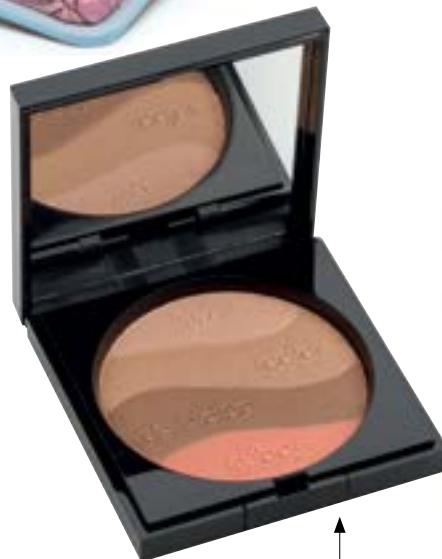
Multicolour Blush No. 04