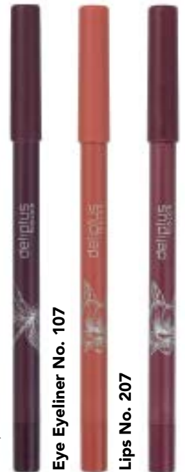
Eye Eyeliner No. 107